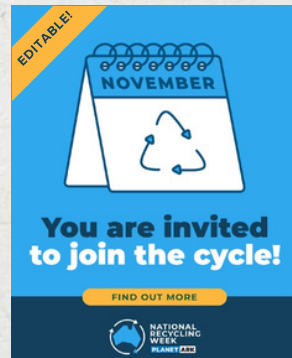
SOCIAL MEDIA TILE