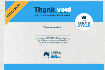
EDITABLE CERTIFICATE (A4)