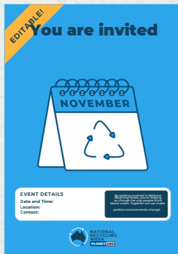
EDITABLE POSTER (A4)