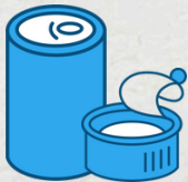
Aluminium & steel cans