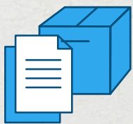
Paper & Cardboard

Conventional materials you may be able to start recycling include: